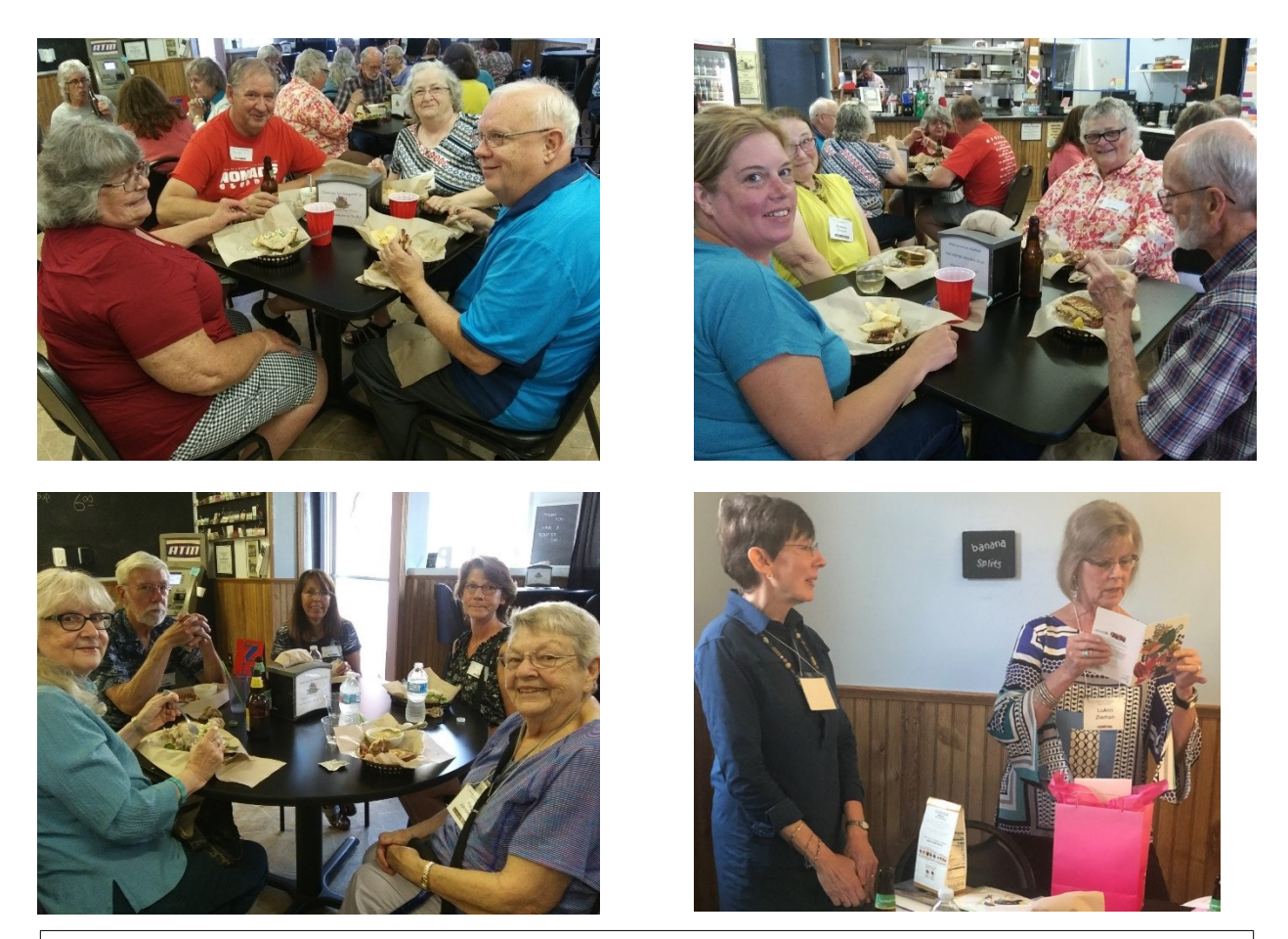
BECOME A LITERACY VOLUNTEERS- MARQUETTE COUNTY MEMBER!

We invite you to become a member and supporter of literacy in Marquette County. One person can make a difference in influencing positive changes. We've accomplished a great deal, but there is so much more to be done. Your services as a volunteer or a financial supporter are critical to our success!